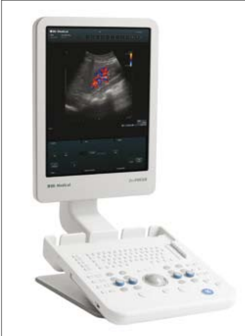
Flex Focus is everywhere you are, from the top of your desk.....