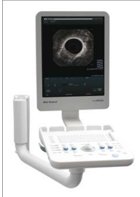
to the wall...