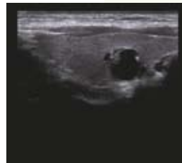
Thyroid with complex cyst