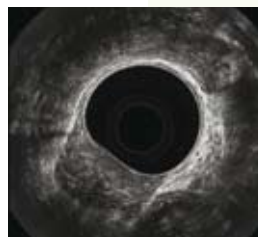
Large rectal tumor visualized by rectal scan